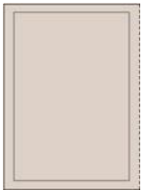
1/1 page 185 x 278 mm